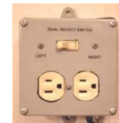
dual side selector switch