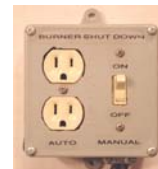
burner shut down